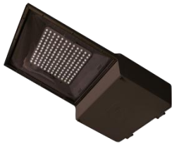
SLN Outdoor Luminaire