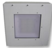
LCN1 Canopy Luminaire