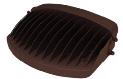
LWS1 Wall Sconce