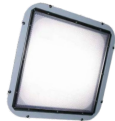
LSF1 Soffit Luminaire