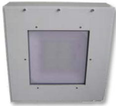
LCN1 Canopy Luminaire