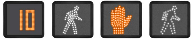
CD Series WM/HM Series EH Series GHM Series

Our pedestrian modules use state of the art technology to provide quality products with unmatched reliability.