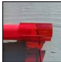
Splice Joint PPCBTL- SJW001 White SJB001 Blue SJR001 Red SJT001 Clear Quantity of 1.