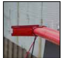
Inside Corner PPCBTL- ICW001 White ICB001 Blue ICR001 Red ICT001 Clear Quantity of 1.