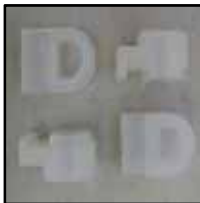
End Cap SIBTL-SB001 Quantity of 1.