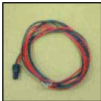
Power Lead CLW-040A 20AWG /40" Quantity of 10.