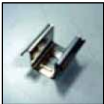
Mounting Bracket BTL-BS02A Quantity of 10.