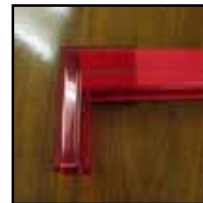
Outside Corner PPCBTL- UCW001 White UCB001 Blue UCR001 Red UCT001 Clear Quantity of 1.