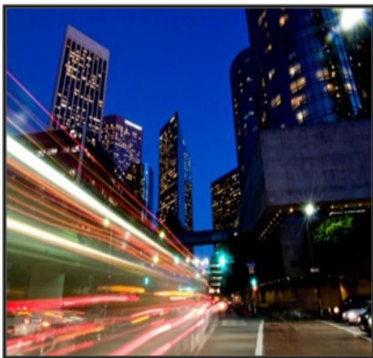
Traffic and Transit

For more information, please visit www.leotek.com .