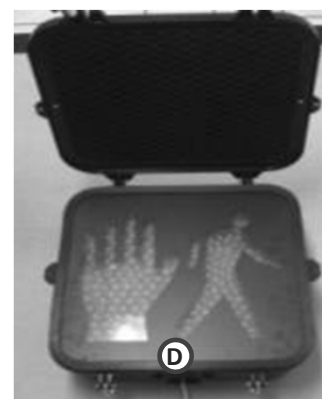
Figure 4 (D) Secure Door